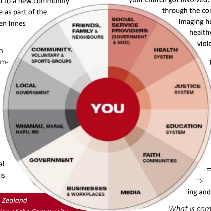
New Zealand Version of the Community Co-ordinated Action Model (2)