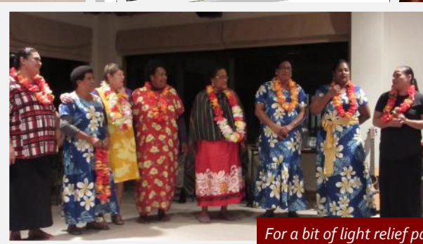
For a bit of light relief participants let off steam with the themed Polynesian night